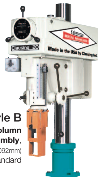
**Style B Head & Column Assembly, 43" (1092mm) Column Standard

**Head and Column Models Furnished with: No. 3MT spindle, head elevating mechanism, column, mounting flange, switch and belt guard. Motor and switches are installed and wired, ready to connect to power.