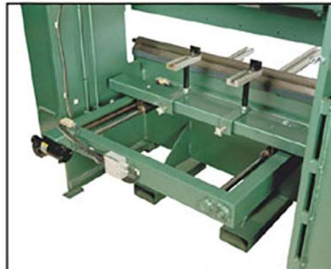
Power Front Reading Backgauge