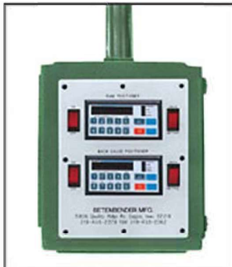
Power Front Reading Backgauge and Power Ram adjustment w/5 Station NC "GO-TO" Positioner on Pendant