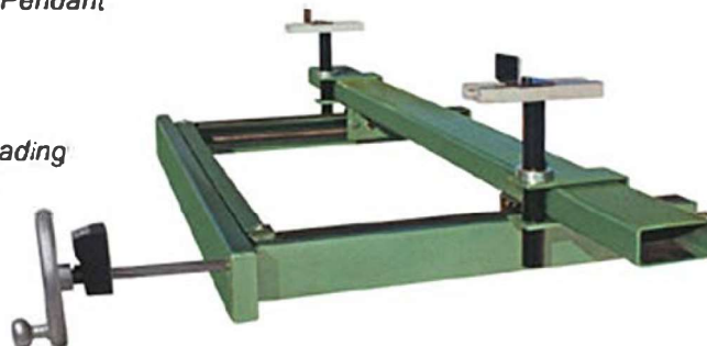
Manual Front Reading Backgauge (24")